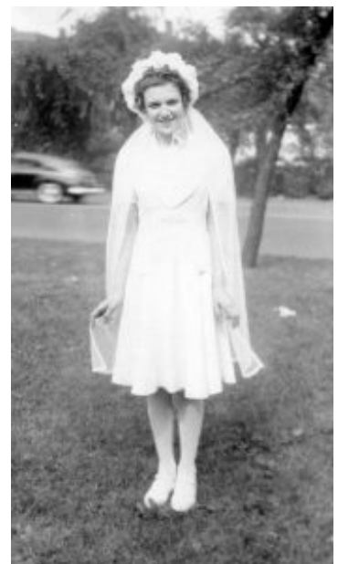
My mom was baptized and received her First Communion when she was 14.

This is what is at the heart of teaching the Real Presence of Jesus Christ in the Eucharist!