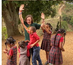
Teens Teach! Seven seniors from Melbourne Central Catholic and two groups of Bishop Moore Catholic High School students and chaperones spent a week teaching English to Dominican students through outdoor activities, songs, games, art and more.