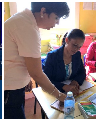
Ten teachers from our Diocesan Catholic schools spent a week leading a bilingual workshop for their peers in our Dominican mission schools. The focus for this year is to have bilingual math and science classes.