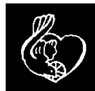
C. J. S. Paluch Co., Inc.

I will put my spirit in you that you may live