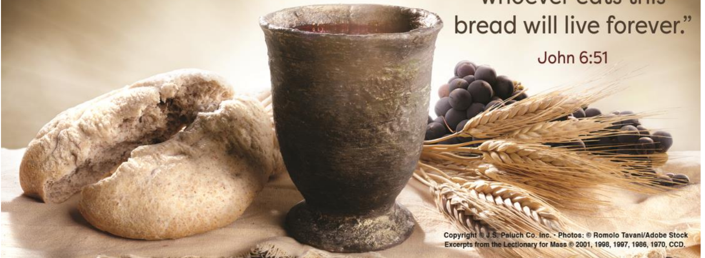
Copyright © J.S. Paluch Co. Inc. - Photos: © Romolo Tavan/Adobe Stock Excerpts from the Lectionary for Mass © 2001, 1998, 1997, 1986, 1970, CCD.