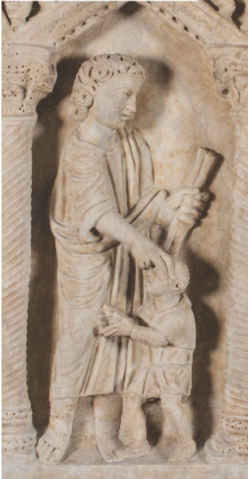
Piece: Sarcophagus (detail of Jesus healing the blind man), fourth century Artist: Unknown Location: Pius-Christian Museum, Vatican