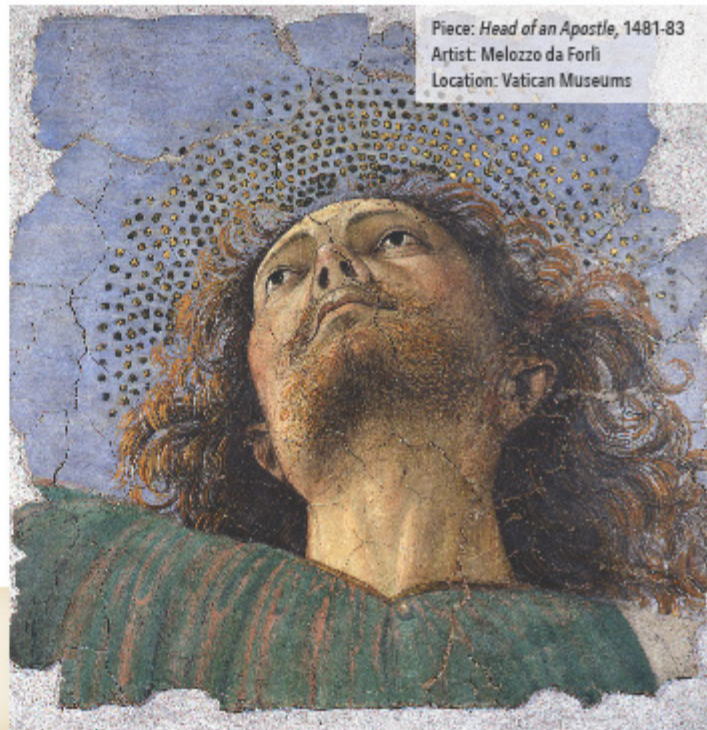
Piece: Head of an Apostle, 1481-83 Artist: Melozzo da Forlì Location: Vatican Museums