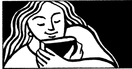
St. Anthony's Parish, 2019

The Diocesan Weekend Retreat for Married Couples will be on the weekend of March 22 – 24, 2019 at the Holiday Inn in Beaumont, TX. There will be also a retreat in Spanish on the Weekend of May 17, 18 & 19, 2019 at the same place. Please register or call the Diocese as soon as possible. For more information, please see the bulletin board.