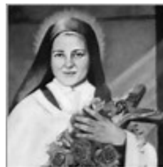
Saint Therese of Lisieux.

Catholic Daughters Court 2662 invites you to enjoy a cup of tea with delights and discover our friends in heaven. Join us in Seton Hall on Thursday, December 15, from 2:00 p.m. to 3:30 p.m. as we reflect on the life of :