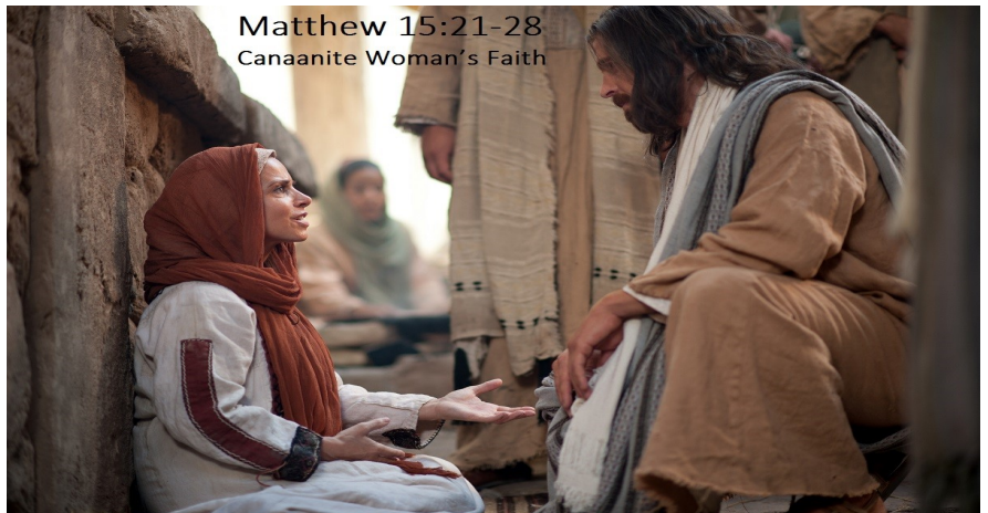
Matthew 15:21-28 Canaanite Woman's Faith

Women's Council would like to thank everyone who helped or donated items for our Flea Market. It has been a great success so far. We still need help on Monday, August 17, at 10:00. We Need help loading our left over items that will benefit the High Plains Children's Home. Thank you again for all your help.