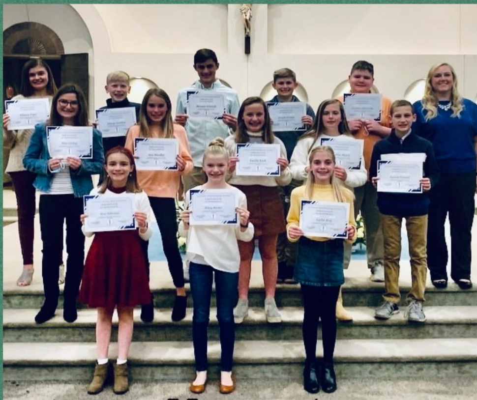
Newest members of NJHS