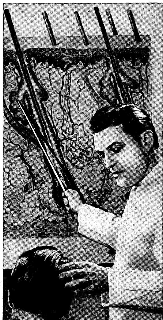
Come in and learn more about your own hair and scalp. Let a Thomas specialist explain its "inner workings" to you.

NOTICE Male pattern baldness is the cause of the great majority of cases of baldness and excessive hair loss, for which neither Thomas treatment nor any other treatment is effective, but Thomas offers you a free examination to determine whether you are one of those who can be helped.