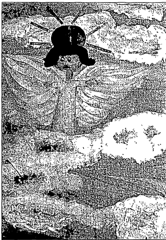
SISTERS OF CHARITY FOUNDATION