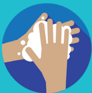
SCRUB: 20 SECONDS