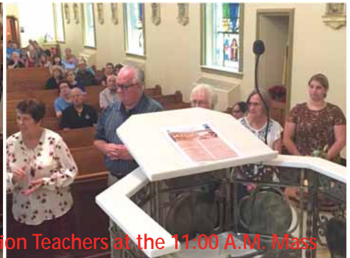
Commissioning of our Religious Education Teachers at the 11:00 A.M. Mass

Ready for the first day of Religious Education