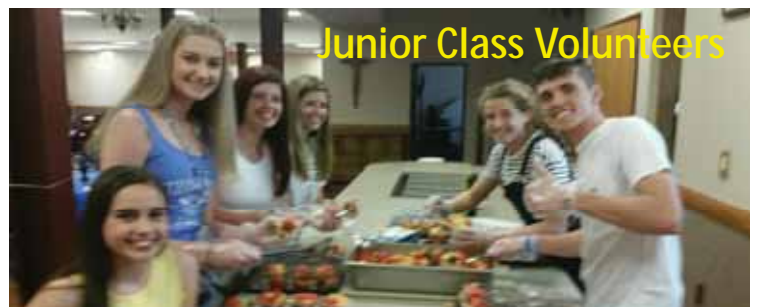
Junior Class Volunteers