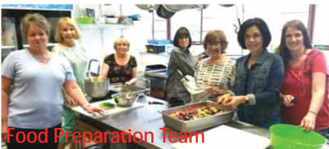
Food Preparation Team