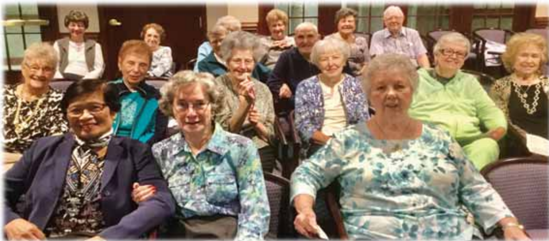
Recent Confession and Communion Service at Concordia Nursing Home