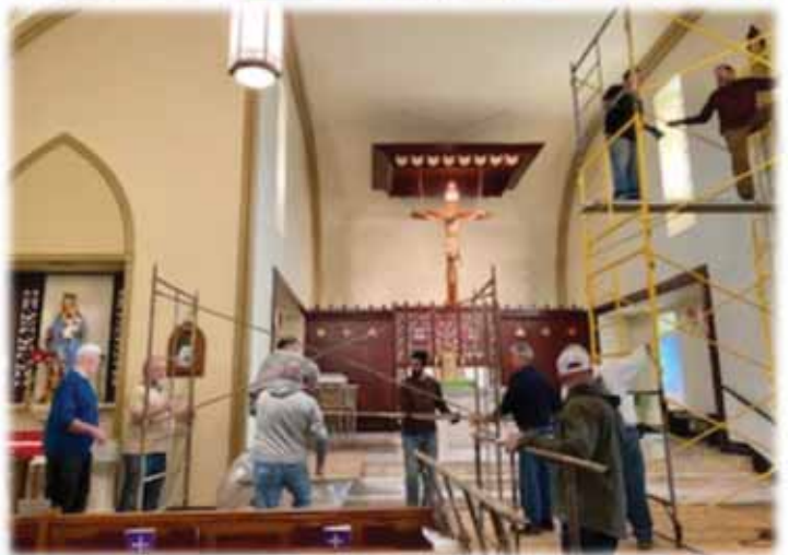
Architecture work in progress... arches into the entrance of the sanctuary