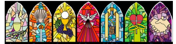
(6-9 Atrium private ownership)

Your child will review the Sacrament of Baptism as foundational to faith and will prepare for the Sacraments of Reconciliation, First Holy Communion, and Confirmation in an interactive and child-centered environment.