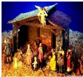
(Bible from all-free-download.com)

The Atrium is a place where your child will work with two and three-dimensional hands-on materials that enable your child to learn the Sacred Scriptures, Sacraments and Prayers of the Catholic Church.