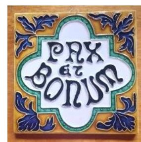
( Personal tile from Italy)

Holy Rosary Parish 12021 Mayfield Road Cleveland, Ohio 44106 Phone 216-421-2995