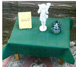
(Personal prayer table 3-6 year Atrium)

The Atrium is a place where your child, from preschool through eighth grade will actively engage in a process of spiritual growth and faith formation.