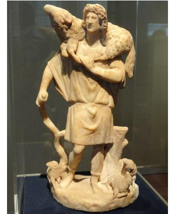
Christ: The Good Shepherd 270-300 AD

This fall, the Atrium program will offer a Toddler Community: Young Family Catechesis through Prayer, Music, and Movement. This early faith experience is for your child six months to three years of age, before your child would enter the Atrium. The goals of these sessions are to: bring joy to the young child through prayer, music, and movement; welcome mothers, fathers, grandparents, and caregivers of the young children to participate in the experience of prayer, music, and movement; assist young families in establishing easy to accomplish prayer and faith filled activities in practice of the Catholic Faith; and broaden the parish community of faith-filled young families. Days to be scheduled. See www.holy-rosary.org