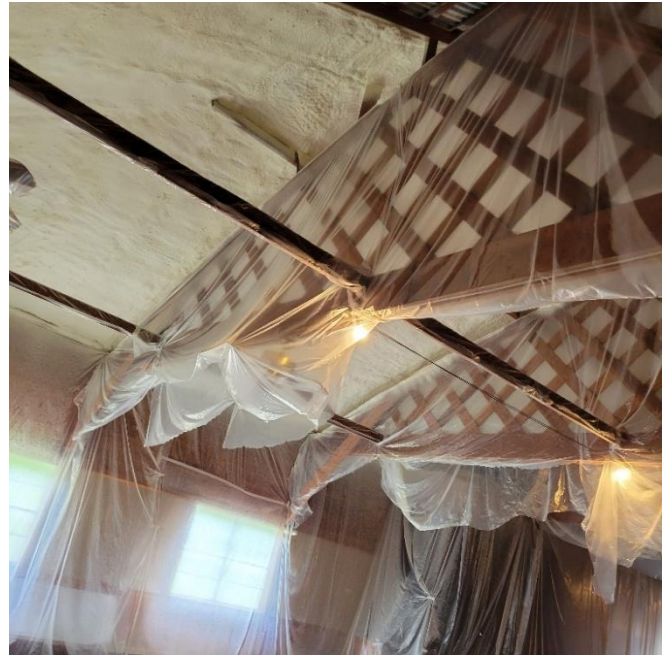
INSULATING HALL CEILING

The workers have been busy this week relocating plumbing and electrical plugs, installing sheetrock in the cooking kitchen and the food serving area. Foam insulation has been blown on the ceiling ready for the air conditioning of the hall. Eight additional new stew kettles were delivered this week.