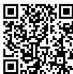
COVID-19 VACCINE PRE-REGISTRATION QR CODE