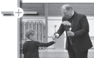
Catholic Appeal Our Church at Work in Maine ROMAN CATHOLIC DIOCESE OF PORTLAND