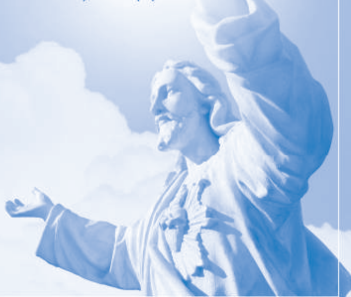
Excerpt from the Liturgy for Mass © 2001, 1996, 1970 CCC. Cover Design © Usuegal Publications, Inc.

“Now glorify me, Father, with you, with the glory that I had with you before the world began. I revealed your name to those whom you gave me out of the world. They belonged to you, and you gave them to me, and they have kept your word.” — Jn 17:1-6