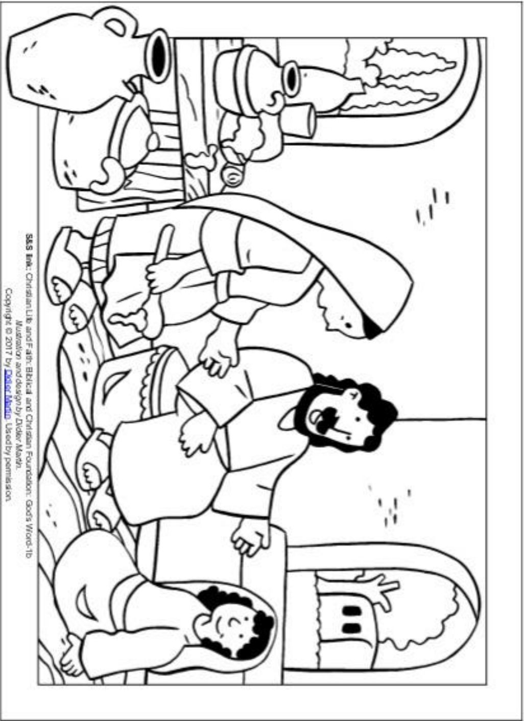
S&S Ink: ChristianLife and Faith Biblical and Christian Foundation: God's Word-1b