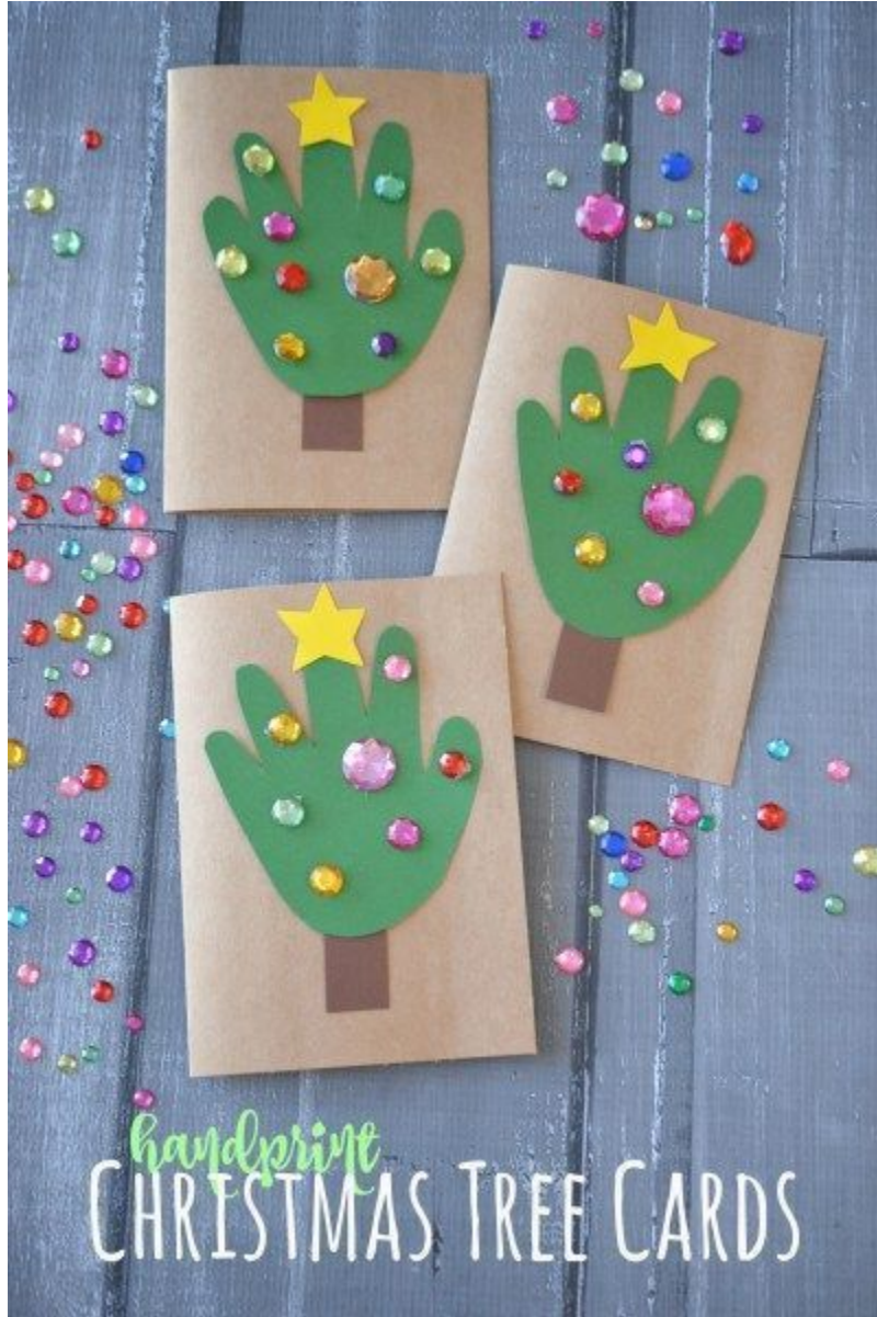
handprint CHRISTMAS TREE CARDS