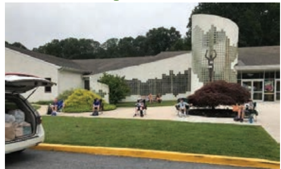
Students waiting for the next car to pull up while staying socially distant.

Seven middle-school youth and adults collected clothing at the parish on Thursday July 23. Six car/van loads of clothing were delivered to the Clothing Bank of Delaware. Thank you to all who donated clothing. If you forgot, no worries. We may have another clothing drive in the fall. Check out our Facebook Page for more photos!