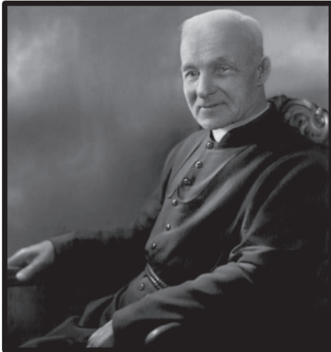
St. André Bessette, pray for us!