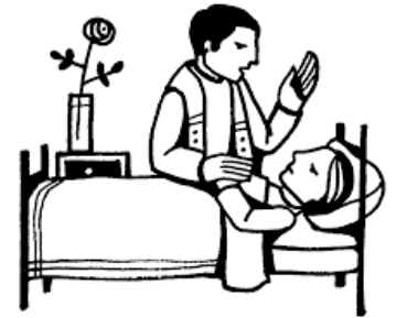
Anointing of the sick

Although often times thought of as a sacrament to be celebrated as someone nears death, and in fact, was previously known as