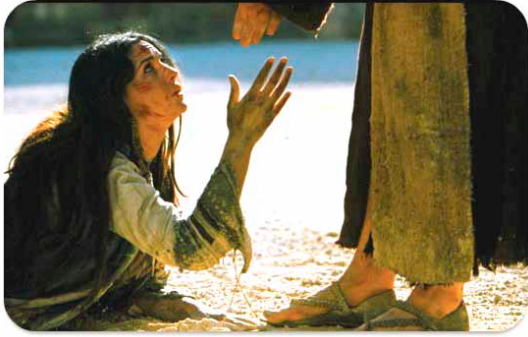
Jesus and the Canaanite Woman