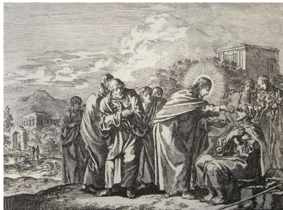
Healing of a Man Born Blind ( click for full-size image )

1. Bap - tized in grace, in grace re - newed By your most ho - ly word. 2. Re - turn - ing us to ways of truth And turn - ing us from sin. 3. Now with your vi - sion heal our eyes, The world's true Light a - lone. 4. Through cross and tomb to East - er joy, In Spir - it - fire ful - filled.