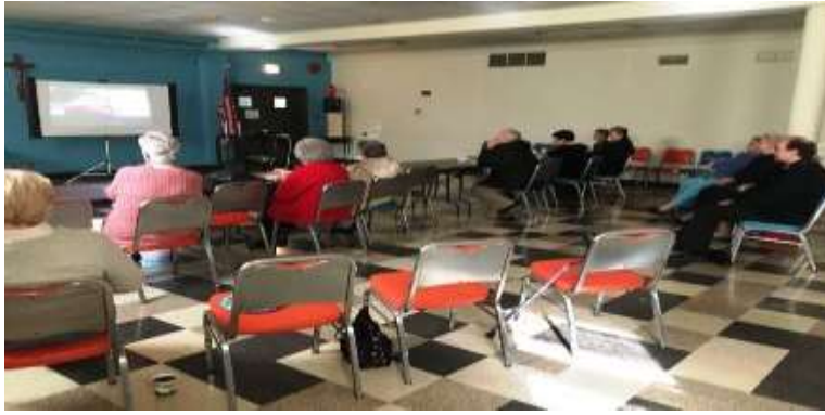
Attendees at the pro-life movie "Unplanned"