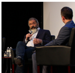
Mel Gibson at the Sheen Center's Hacksaw Ridge advance screening in November