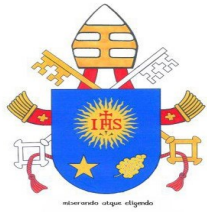
Pope Francis Rome, Italy

Visit us at: www.saintann-somerville.org