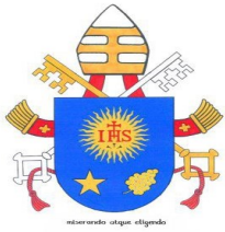
Pope Francis Rome, Italy

Visit us at: www.saintann-somerville.org