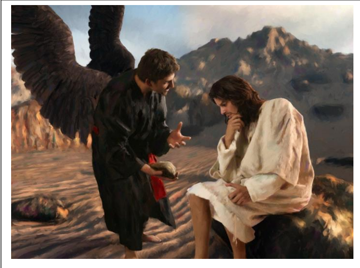
Jesus was tempted by Satan.