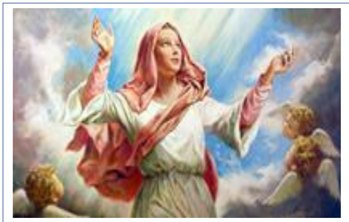
Queenship of the Blessed Virgin Mary