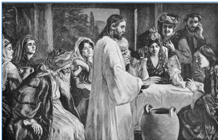
Jesus turns water into wine.