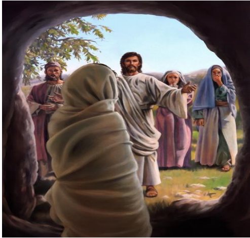
Jesus cried out in a loud voice, "Lazarus, come out!"