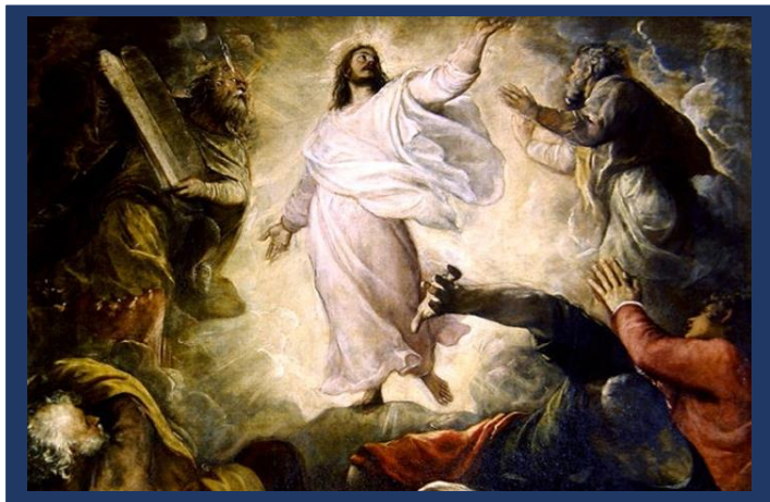
The Transfiguration of Jesus