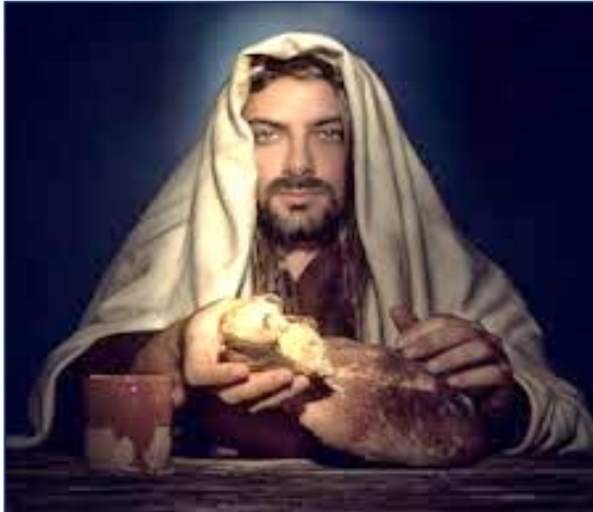
I am the living bread that came down from heaven.