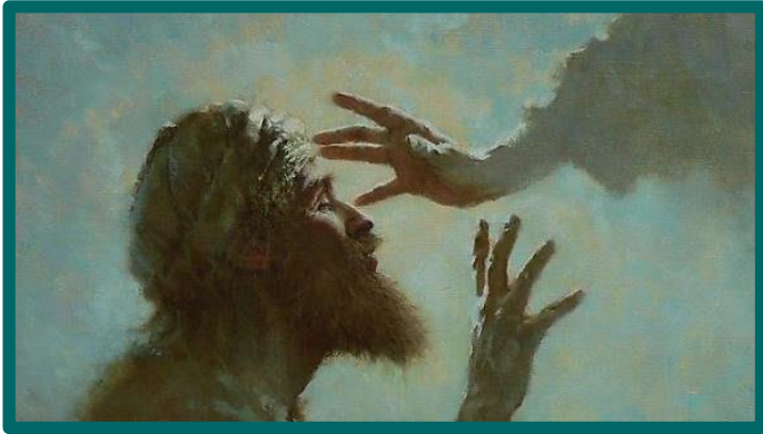
Gospel: The Blind Man's faith. (Mark: 10: 46-52)