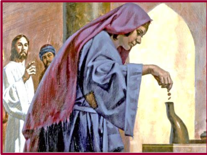
The Poor Widow's contribution.