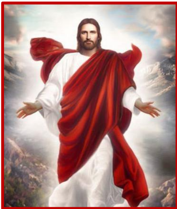
And then they will see 'the Son of Man coming in the clouds' with great power and glory. MARK 13:26