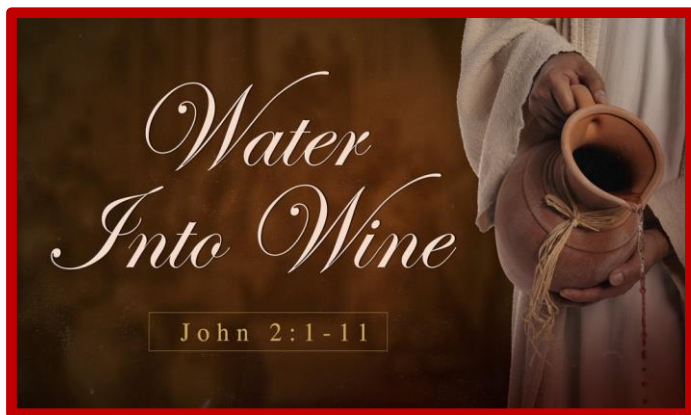
Jesus' First Miracle