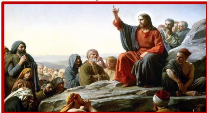
The Sermon on the Mount