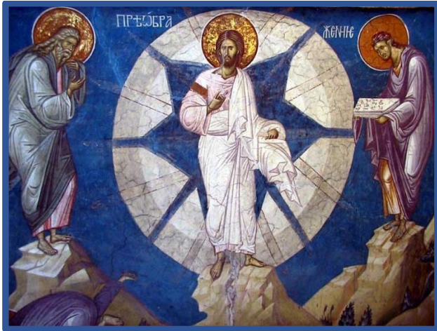
The Transfiguration of Jesus