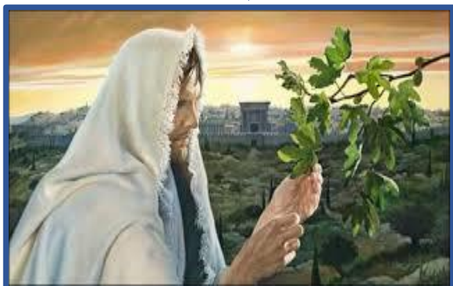
Parable of the Barren Fig Tree