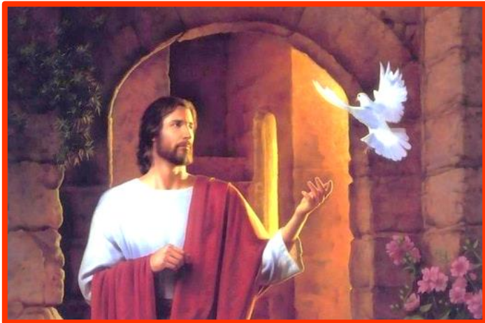
The Holy Spirit will teach you everything. (John 14:26)