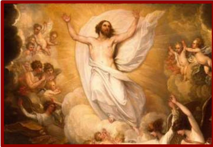
The Resurrection (Luke 20:27-38)