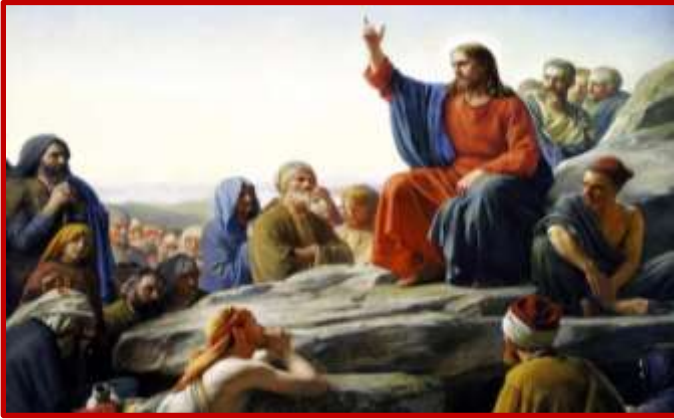
The Sermon on the Mount