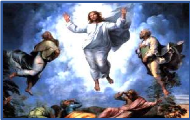
The Transfiguration of Jesus