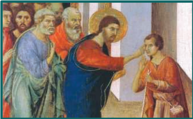
Jesus heals a man born blind.